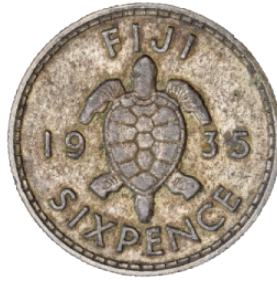
Lot 2: 1935 Fiji Sixpence; Very Fine