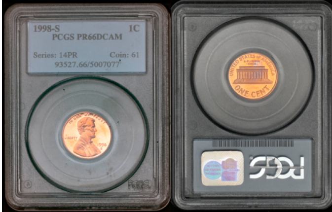
Lot 3: 1998-S Lincoln Memorial Cent; PCGS Proof-66, Deep Cameo